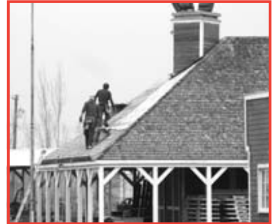
Repair of steamer shelter roof.