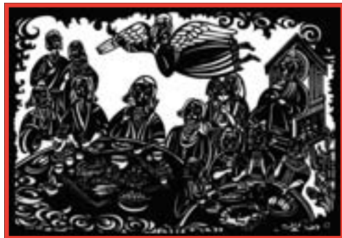
Untitled by Gen Tsuboi, Kirie (cut paper).

The right to food has been declared to be a human right. The International Covenant on Economic, Social and Cultural Rights (1976) affirms "the right of every man, woman and child, alone and in community with others, to have physical and economic access at all times to adequate food or means for its procurement in ways consistent with human dignity."