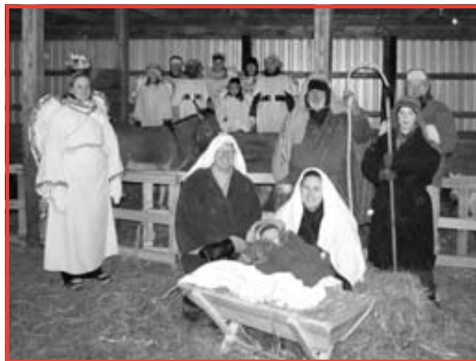
Living Nativity scene

As the crowd neared the stable, the sounds of Silent Night filled the