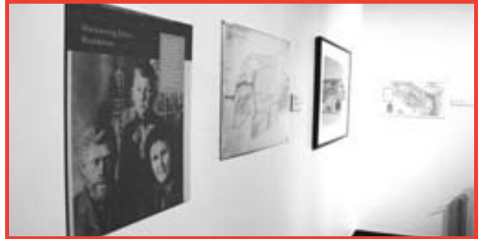
Landscape as Memoir: Mennonites and Maps exhibit.

This exhibit explores not only maps made by Mennonites from all over the world, but the meaning of these maps: how they acted to memorialize home places, maintain ethnic boundaries and lay claim to land and inheritance. The exhibit includes all original maps and models.