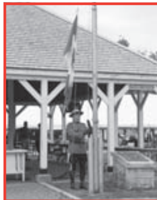
Flag raising ceremony.