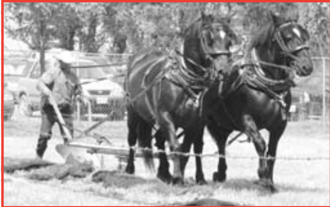
Fall on the Farm ploughing demonstration

and refreshments can be enjoyed by everyone in attendance. Bring your family and plan to make this an annual tradition as a start to the Christmas season.