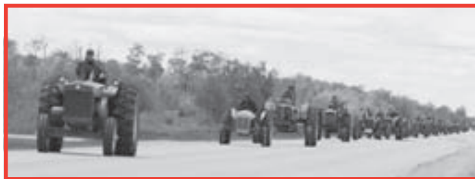
Tractor trek traveling through the countryside.

On June 4 th we had our second annual Tractor Trek Fundraiser event, a joint venture between MHV and Eden Foundation. Forty-seven vintage tractors participated in a 40 kilometer ride through the countryside. More than $34,000 was raised. Both participants and funds raised were significant increases over last year's event. All funds were equally shared by MHV and Eden East. The day's event concluded with a banquet and entertainment. Plans are already developing for another event next year. A big thank you to all the drivers who worked diligently to collect pledges, and to the sponsors and contributors who helped make this fundraiser a success.