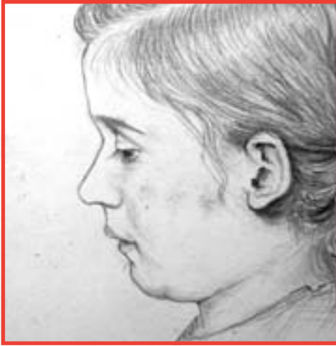
Girl, 1945, illustration by Kornelius Epp.

Dozens of sketches and oil paintings by Mennonite artist Kornelius Epp were exhibited in the Gerhard Ens Gallery. These included scenes from Ukraine, Germany, Paraguay and Canada that Epp had created during his sojourn in these very different lands.