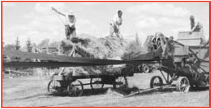
Fall brings harvest time as volunteers keep the threshing machine working

The last event of the season is Touch of Christmas – A Living Nativity which will be presented on December 2 and 3. The Living Nativity is an outdoor performance, a portrayal of the Christmas story featuring live animals and actors of all ages drawn from Steinbach and surrounding communities. The play will be presented on Friday and Saturday evenings. Sleigh rides, fire pit, hot chocolate,