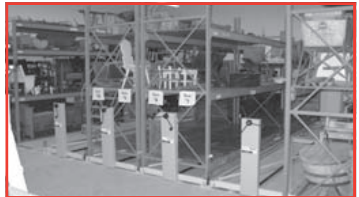
Rolling shelving helps make efficient use of our environmentally controlled artifact storage areas.