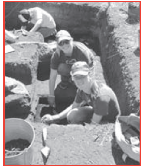
Steinbach Regional Secondary Students putting in a full day's dig.

A rolling storage unit was installed in our Permanent Artifact Storage Room to increase our storage space for large artifacts and new shelving was purchased for the archives (funded by Museum Assistance Program, the C.P. Loewen Family Foundation, the Winnipeg Foundation, the R.M. of St. Anne and the MHV Auxiliary). Important volunteer assistance in moving artifacts was provided