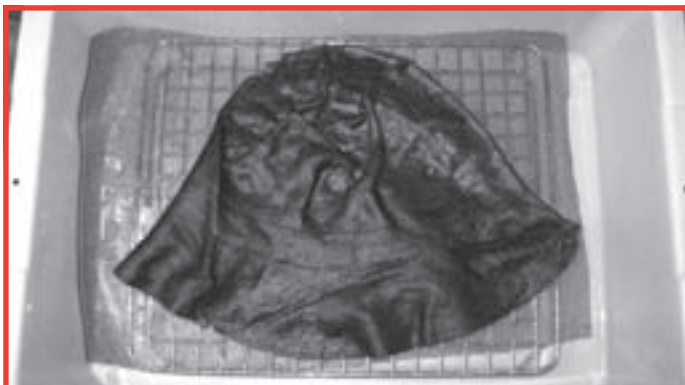
This nearly complete felt hat was unexpectedly discovered at the site encased in clay, which probably helped preserve it. It is currently undergoing conservation treatment at the MHV for inclusion in a summer 2012 exhibit.